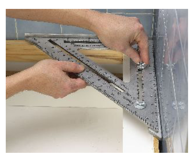
3. While holding the square flat and tight against the back wall, align the Layout Bar flush with the side wall and tighten the rear-most wing nut.