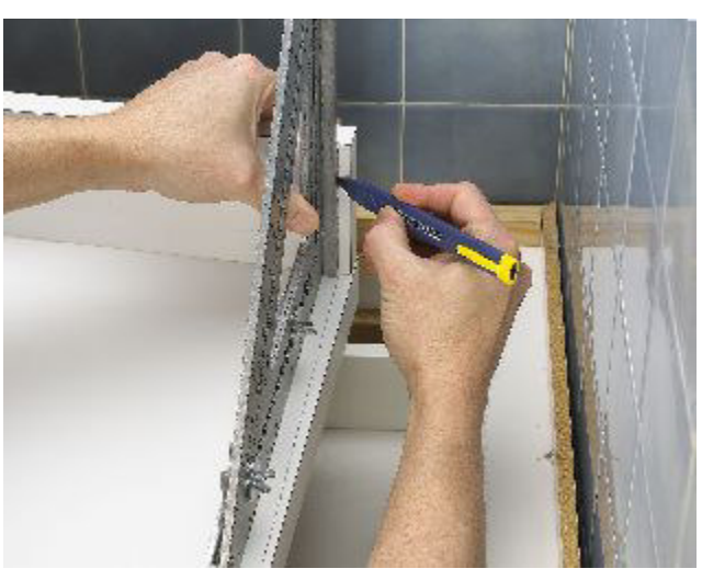
6. Stand the Big 12® Speed®Square to mark the back splash.