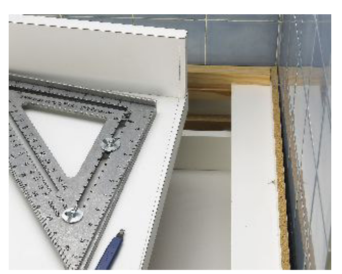
7. Final markings... ready to be cut.