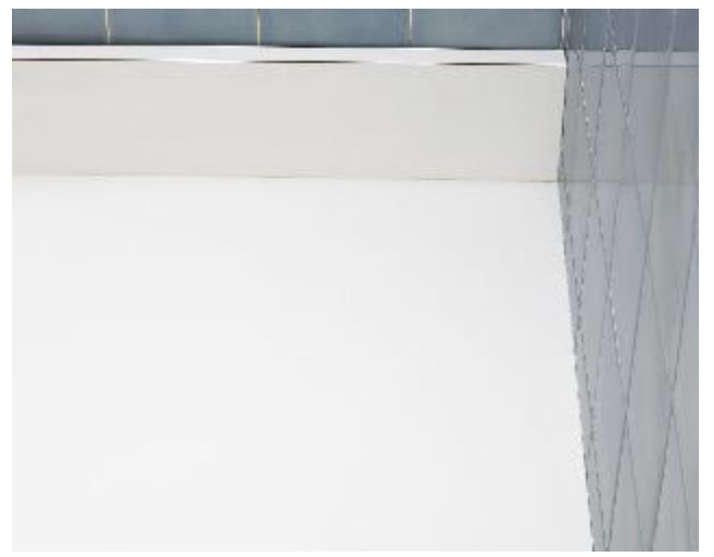
8. THE RESULT: a perfect countertop fit.