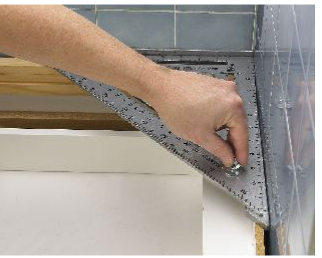
4. Keeping the square in position, tighten the front-most wing nut.