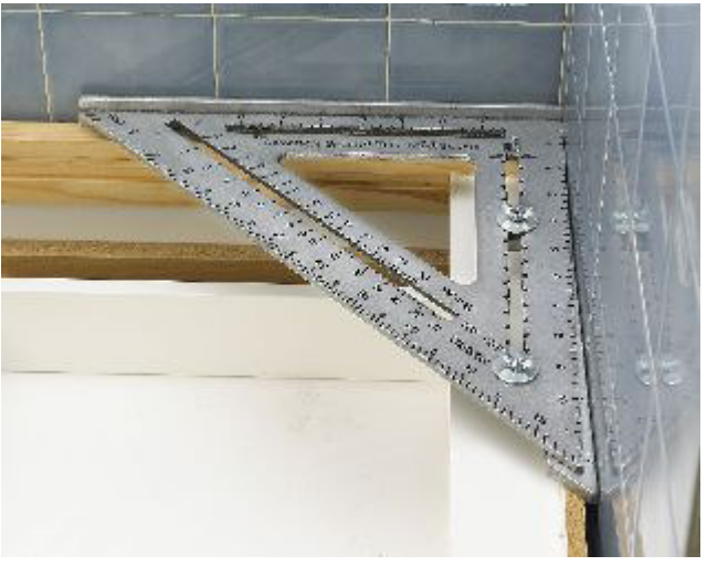
SOLUTION: Remove the 2 hex pegs (and bolts) and lossen both Layout Bar wing nuts. Place the Big 12® Speed®Square flush with back wall.