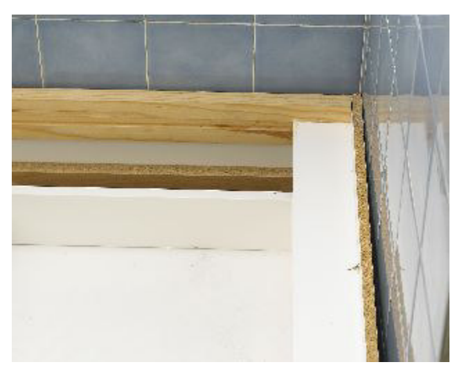
1. PROBLEM: An out of square corner.